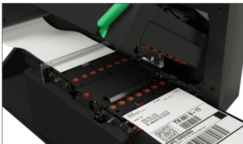
Printing up to 24 linerless labels per minute, The duplex thermal transfer/direct thermal printhead prints to both the top and bottom simultaneously.