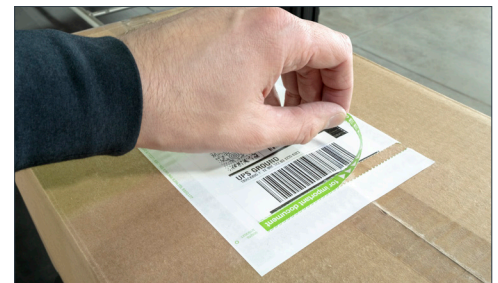
Duplex labels combine the shipping and packslip labels to a single label, eliminating the need for additional plastic pouches, materials, and labor.