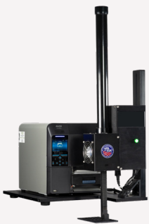
100% electric system, reducing operational expenses by requiring no compressed air.

Mitigation of waste and loss due to human error or outdated manual processes.