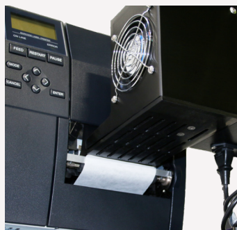
Labels printed on the Shadow are immediately available for application, as there are no labels queued up.