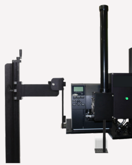
Shadow with optional stand for top or side label application solution.