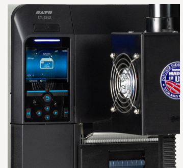
OEM SATO print engine capability